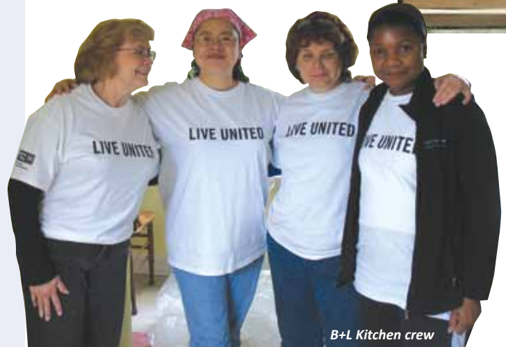
B+L Kitchen crew